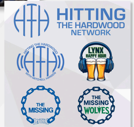
HTH Network of Podcasts